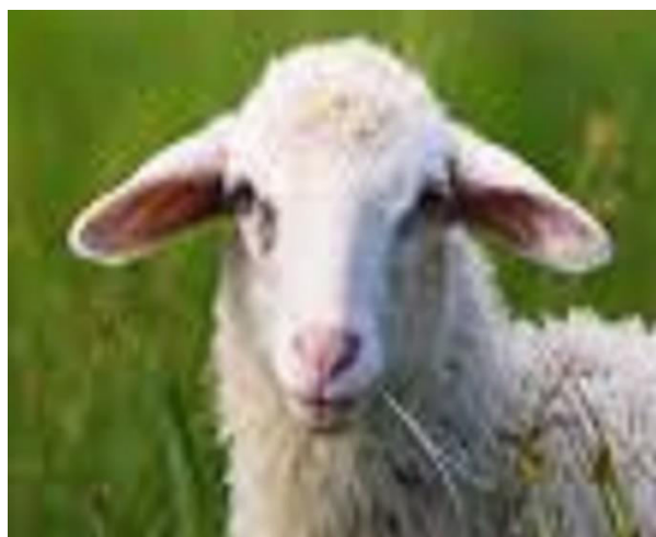
Figure 2. Input image